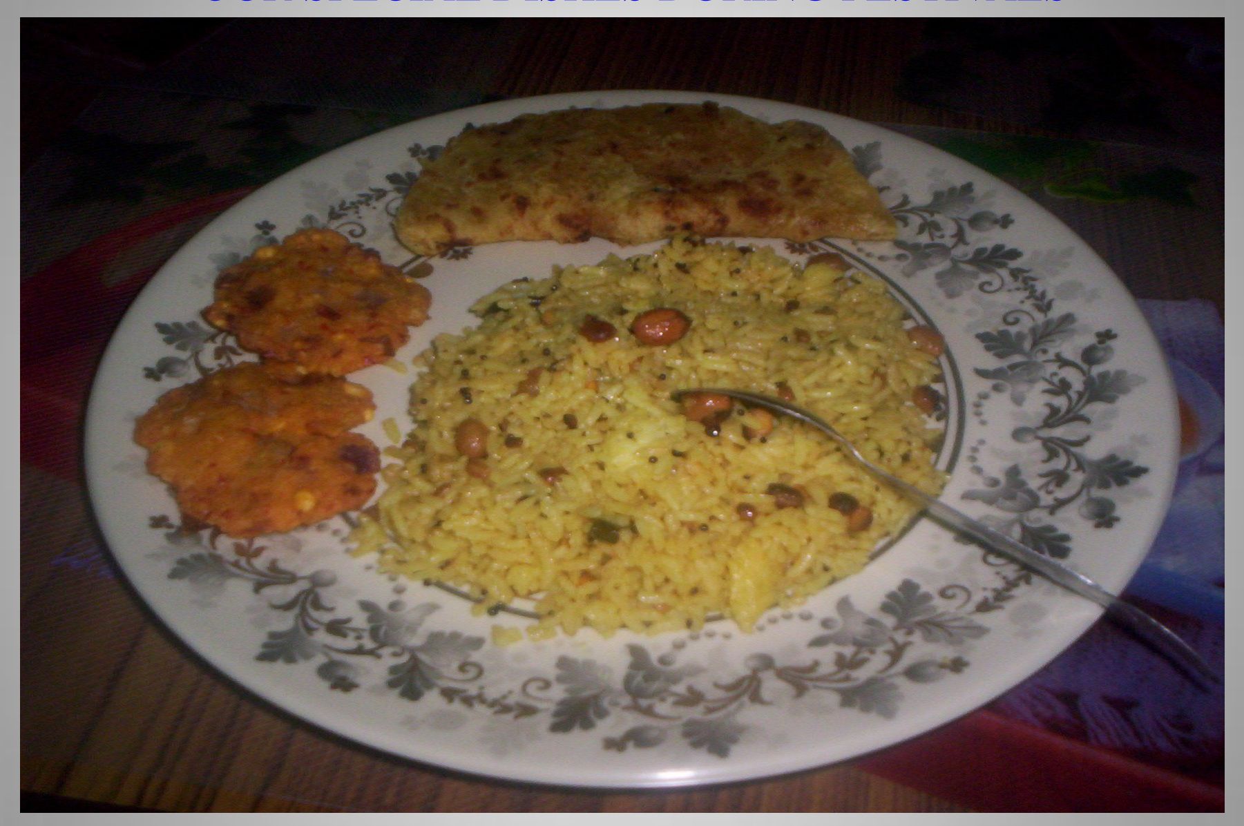
TAMARIND RICE Www.makenegenlus.com HAPATI AND VADA Free Sccience Videos for Kids