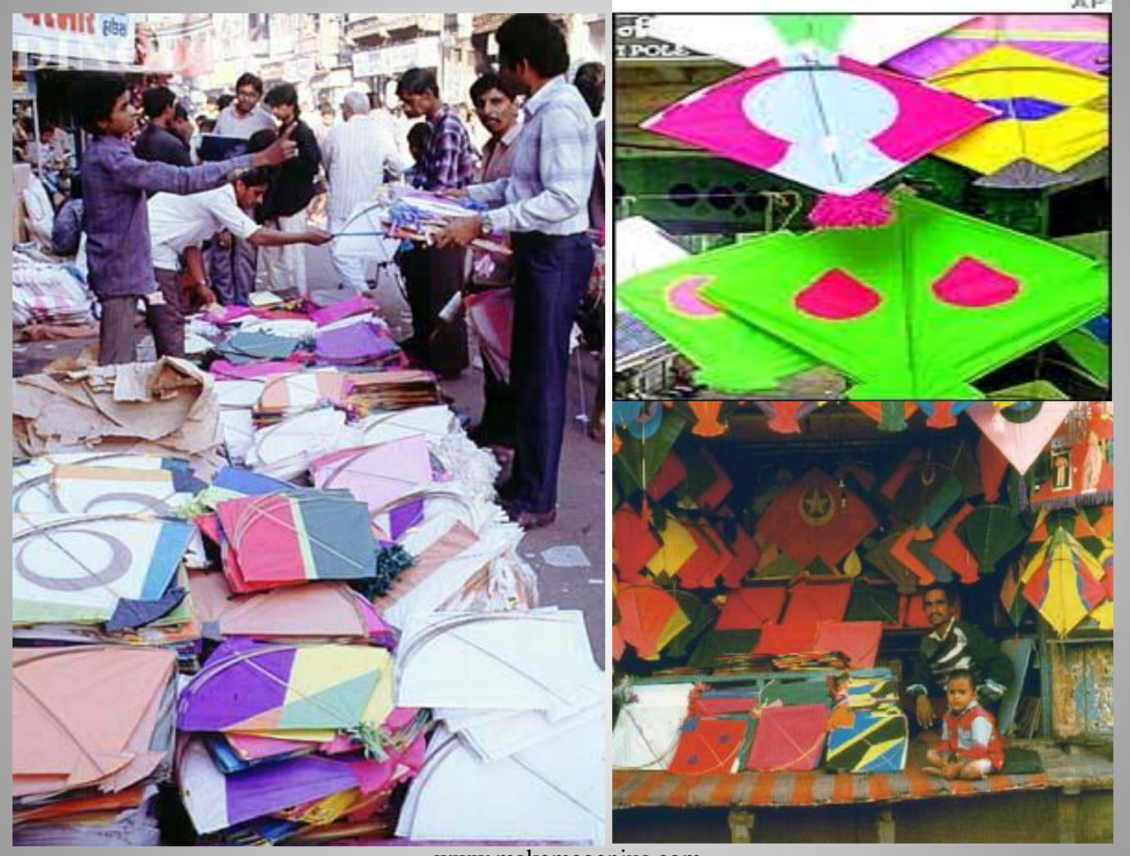
There is no barrier of caste street videos for Ridor region for flying kites.