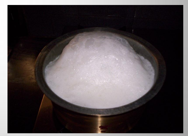
Modern way of cooking Pongal www.makemegentus.comass vessel on LPG stove. Free Sccience Videos for Kids